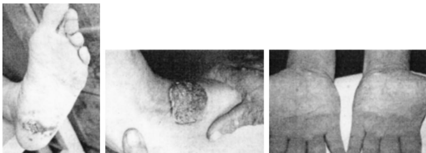
FIG. 2. Photos showing arsenic-induced lesions of the skin. From left to right: Keratotic (ulceration) lesions of the foot, leg and hands.

In China, geoscientists are working with the medical community to seek solutions to arsenic and fluorine poisoning caused by residential burning of mineralized coal and briquettes. Chronic arsenic poisoning affects least 3,000 people in Guizhou Province, P.R. China. Those affected exhibit typical symptoms of arsenic poisoning including hyperpigmentation (flushed appearance, freckles), hyperkeratosis (scaly lesions on the skin, generally concentrated on the hands and feet; Fig. 2), and Bowen's disease (dark, horny, precancerous lesions of the skin). Chili peppers dried over open coal-burning stoves may be a principal